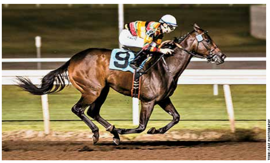
Bling It On Baby won three races and finished second in a stakes for Mojo Racing

(continued from page 40) gram, and we rely on that."