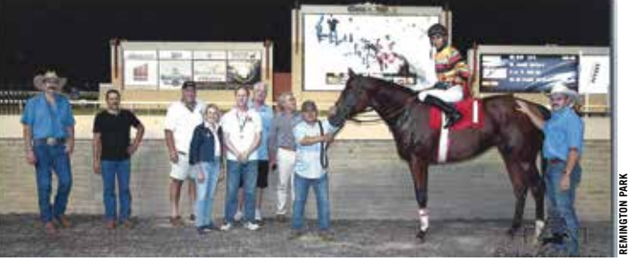
Mojo Racing competes at meets in Oklahoma, Texas, Kentucky, Louisiana, and Arkansas